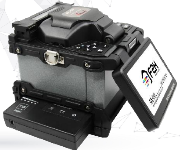
Detachable 5200mAh Li-battery (>250times splicing and heating cycle)