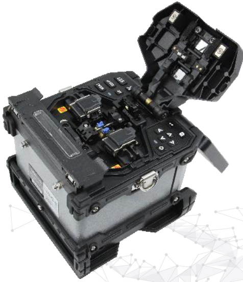
Large opening angle (Convenient splicing operation)