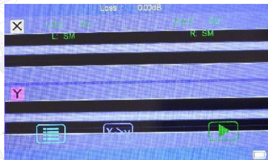
Stable and low splice loss (Excellent splicing loss performance)