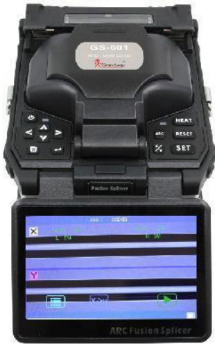
Fully automatic operation (6s fast splicing and 18s heating)