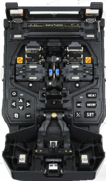
Multi in one metal precise fiber holder (0.25/0.9/2/3mm/drop cable)