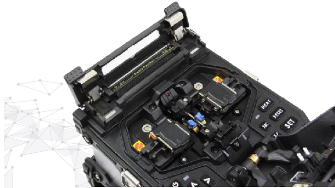
Inductive automatic heater (Heating time and temperature both adjustable)