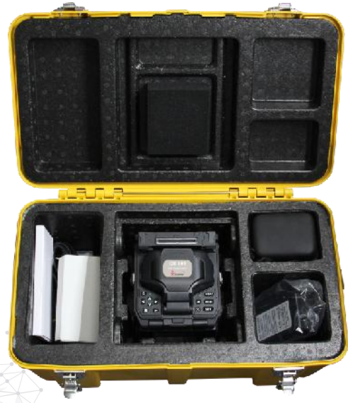
Large capacity carrying box (sturdy and durable)